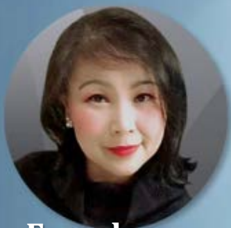
Founder Executive Coach